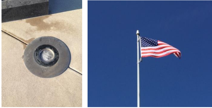
Before (bottom up) After (solar top down)

Lighting still remaining within the park that is currently not in compliance with the LMP includes the following: